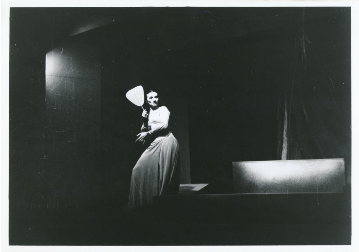
Bella Lewitzky in Salome, choreographed by Lester Horton, 1948

Born while her parents were members of the socialist Llano Del Rio Colony in the Mojave Desert, raised on a chicken farm in Highland CA, Lewitzky became the star of the Lester Horton Dance Group based in Los Angeles, the first American inter-racial dance company.